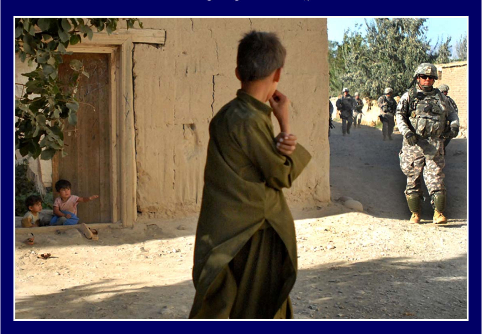
U.S. House of Representatives • Committee on Armed Services Subcommittee on Oversight & Investigations